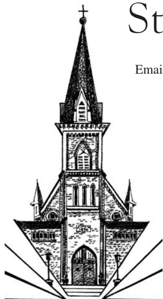
St Louis Catholic Church